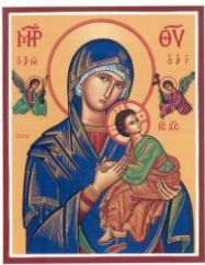
Our Lady of Perpetual Help