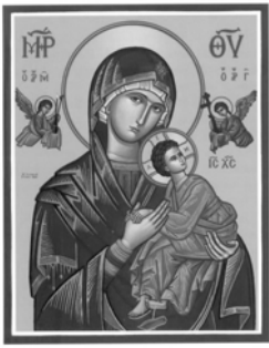
Our Lady of Perpetual Help